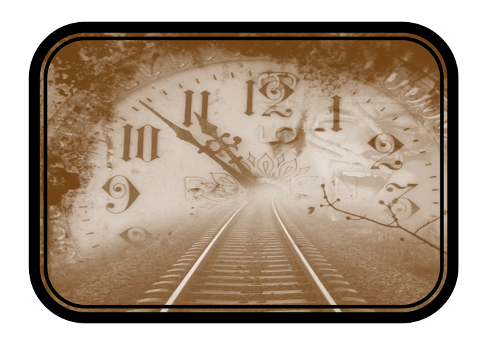
VISIT US AT www.AwakeningsPrayer.org